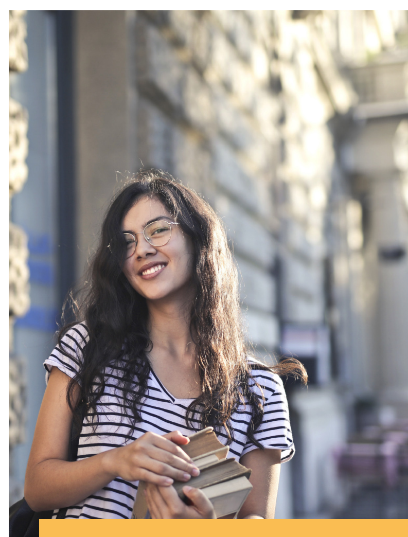
Along with federal funding, state grants are a fantastic way for Institutions of Higher Education to increase their budget.

State grant programs are an important source of funding for higher education institutions, providing funding to support programs, initiatives, and research. By understanding the state grant programs available, and following the application procedures carefully, institutions can increase their chances of securing funding to support their goals and improve the educational experience for their students. Institutions should consult their state's higher education agency website for more information about state grant programs available in their state.